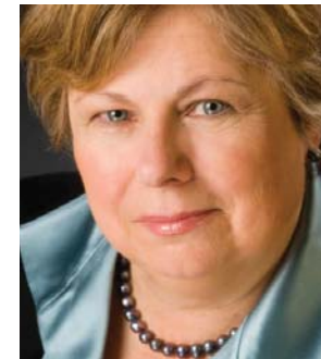
Nanette Lee Miller Community Champion Award