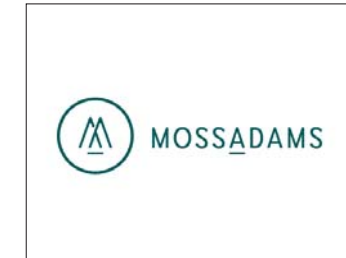
Moss Adams LLP Corporate Partner Award